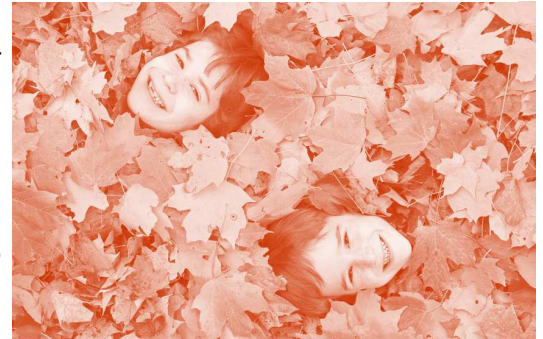
Summer is over already!

And lastly, we encourage you to come to our Parent's Information Meeting and Annual General Meeting. If you are considering serving on the Board of Directors you must attend the meeting to be voted in. If you want to receive information about our year, policies, etc. this is a great place to come and receive that information or ask questions re-